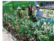
Make new friends

For more information and to apply online, visit: