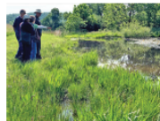
Learn from experts