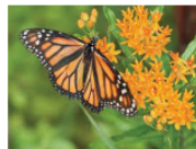
Help the environment